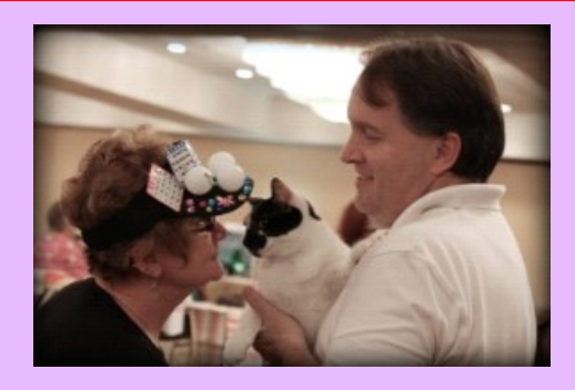
You have to BUY the BINGO sheets to win at BINGO!