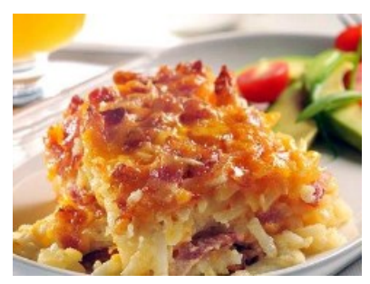
Potato Bacon Casserole