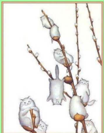
Cat lovers version of a pussy willow tree